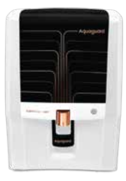
Storage Capacity: 7 Litres