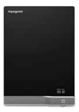
Storage Capacity: 4 Litres