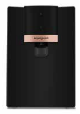
Storage Capacity: 6.2 Litres